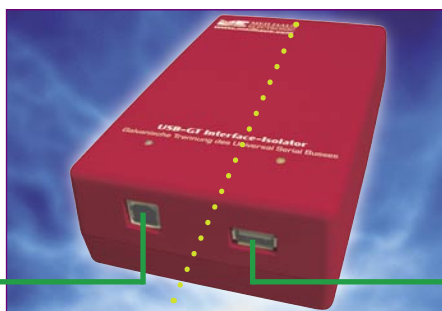
Interface isolator USB-GT: Full galvanic isolation up to 4 kV