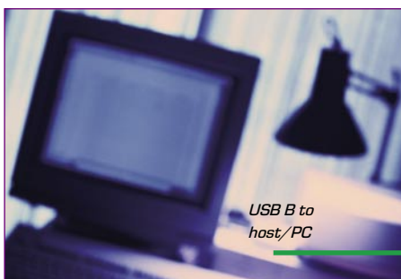
USB B to host/PC